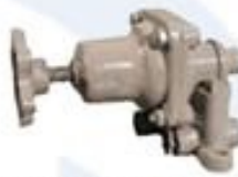
HS4 Control Air Valve