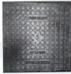
Rectangular Manhole Cover