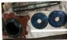
Radiator Fan Components