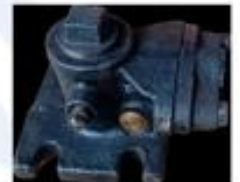
Sand Ejector Valve