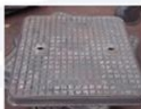
Square Manhole Cover