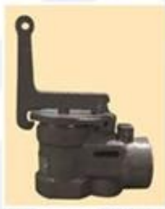
D1 Emergency Brake Valve