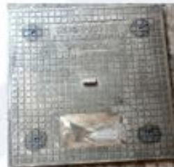
DI 520x520 solid Top