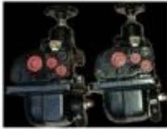
A9 Automatic Brake Valve