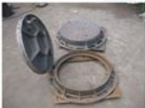
Round Manhole Cover