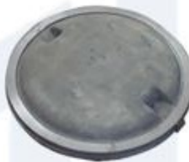
Round Manhole Cover