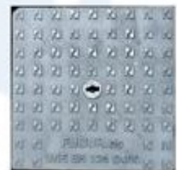
DI 500x500 solid Top