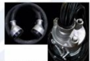
Receptacles & Jumpers