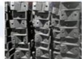
Cast Iron Bracket