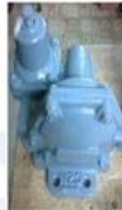
C2N Feed Valve