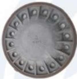
Round Manhole Cover