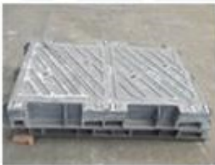
Double Triangular Manhole Covers (Single & Multi Tops)