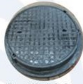
Round Manhole Cover