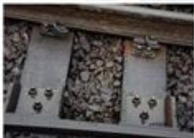
Railway Track Parts