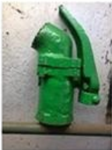
Cut Off Angle Cock