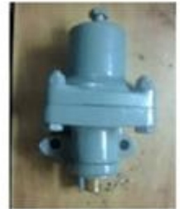
C2W Relay Air Valve